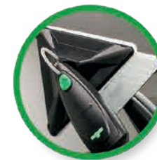
Press the pad flat against the window