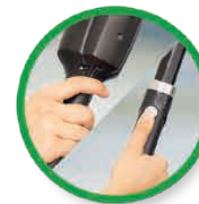
Hold button on unit or pole for a maximum of 1 second

During the cleaning process, use as little liquid as possible. If you need to re-moisten the pad, hold the activation button for about one second. Pad only needs to be damp to achieve the best cleaning results.