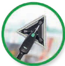
Press the pad flat against the window