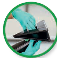
Attach Adapter Plate