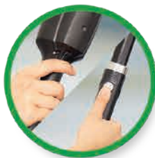
Hold button on unit or pole for a maximum of 5 seconds and use circular motions to dampen the entire surface of the pad