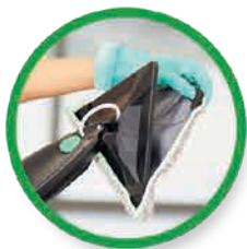
Attach Microfiber TriPad