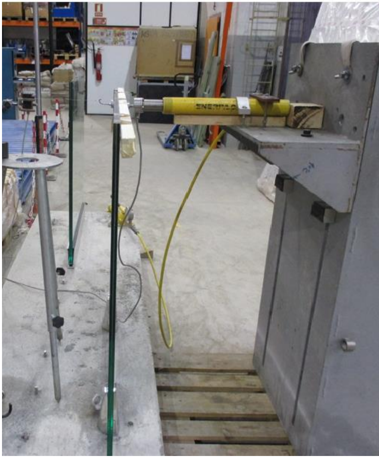
Appearance after horizontal outward push